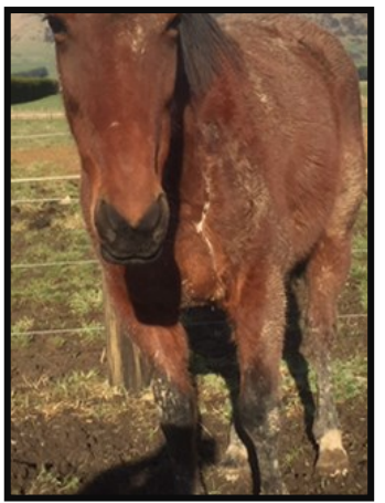
The result mid-August: Fully sound

down' but the resulting wound is usually smaller. The dead tissue is removed at a later visit so as not to delay secondary healing. The vet will also decide if bandaging is required (in some cases it can delay healing) which antibiotics to use, provide a tetanus shot if required, and give antiinflammatories. Rochelle Smith BVSc MANZCVS